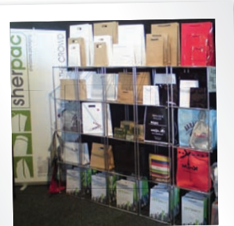
Autumn Gift Fair ASB Showgrounds, Greenlane, Auckland. March 11'