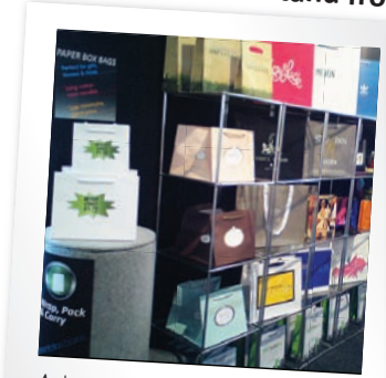
Autumn Gift Fair ASB Showgrounds, Greenlane, Auckland. March 11'

Check out our stand from the Autumn Gift Fair!