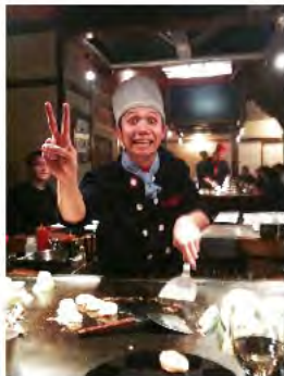
Thank you to Lovie for cooking such yummy food & for keeping us so well entertained!