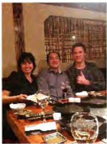
Eileen, Norman & Hayden waiting on their feed